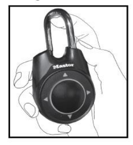
1. Place lock in the open position.

You can set your combination to any pattern of any length. For extra security, it is best to create a longer combination using several of the up, down, left and right positions. Write the combination down once you change it! FOLLOW INSTRUCTIONS EXACTLY!